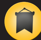
TWO- DIMENSIONAL DESIGN