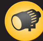
SERVICE LEARNING SHOWCASE