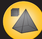
THREE- DIMENSIONAL DESIGN