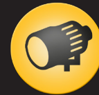
SERVICE LEARNING SHOWCASE