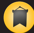
TWO- DIMENSIONAL DESIGN